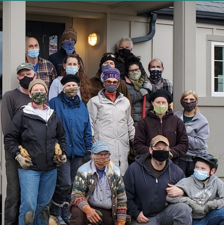
Master Gardeners join together to help with the new Family Resource Center landscaping.