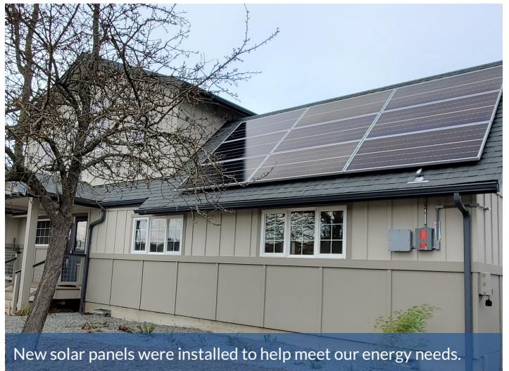
New solar panels were installed to help meet our energy needs.