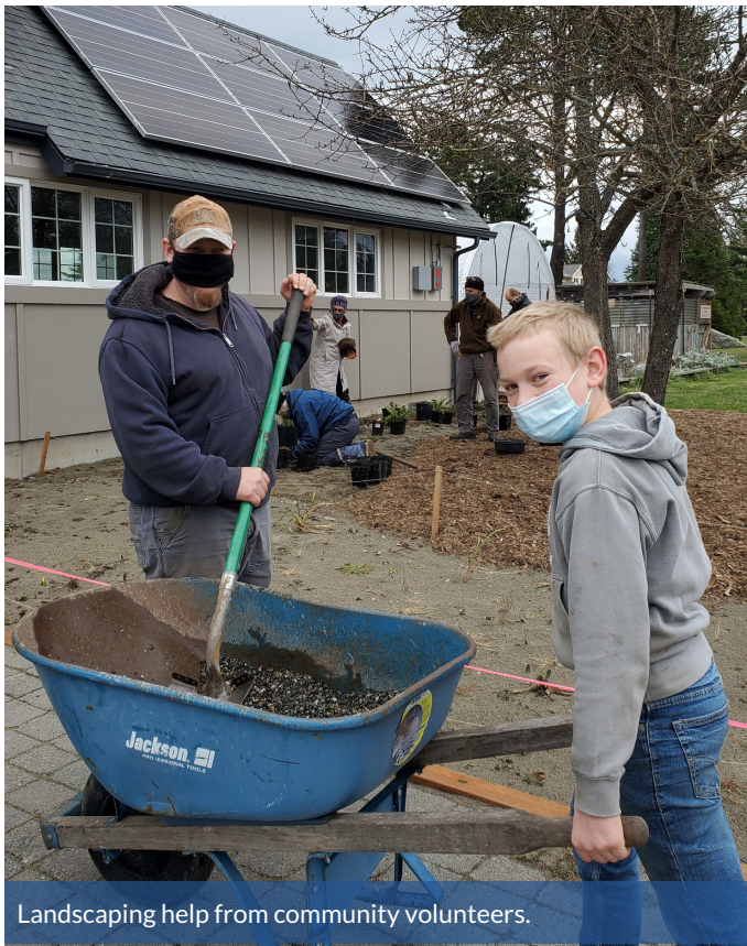
Landscaping help from community volunteers.